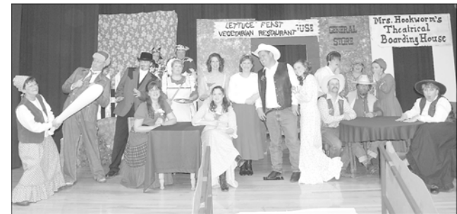
2008 Polish Days Melodrama